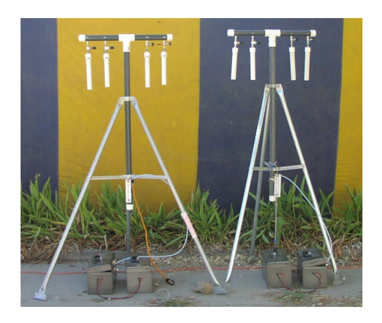
Figure 2: Example of an active sorbent tube sampler.