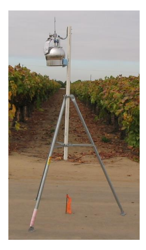
Figure 1: Example of a passive canister sampler.